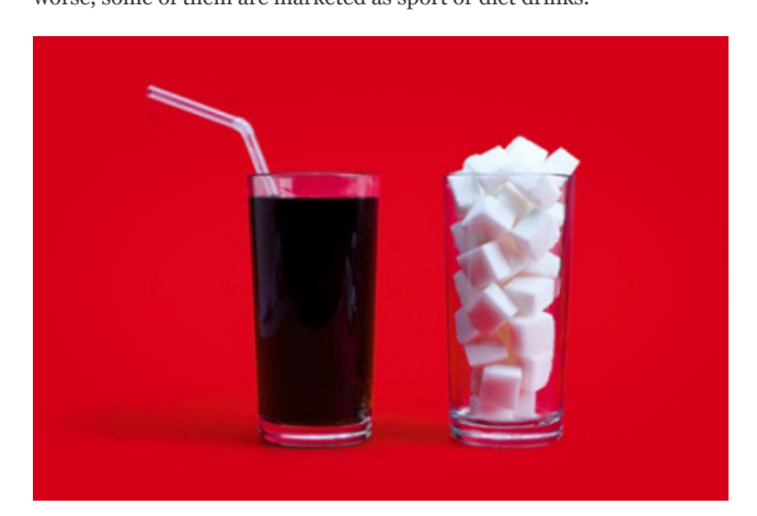
Even 100% juice has sugar content equivalent to a handful of Oreos. Juices and smoothies, rich in nutrients as they are, have the sugar and calories of a meal, but without the satisfaction offered by solid food. Dr Caruana emphasises that it is important to clearly distinguish two different goals: weight control and nutrition. "Even

According to Harvard School of Public Health, sugary drinks are "a major contributor to the obesity epidemic," with studies showing that soft drinks can boost genetic tendency to gain weight. Moreover, even low-calorie drinks stimulate appetite for more sugar, and what's worse, some of them are marketed as sport or diet drinks.